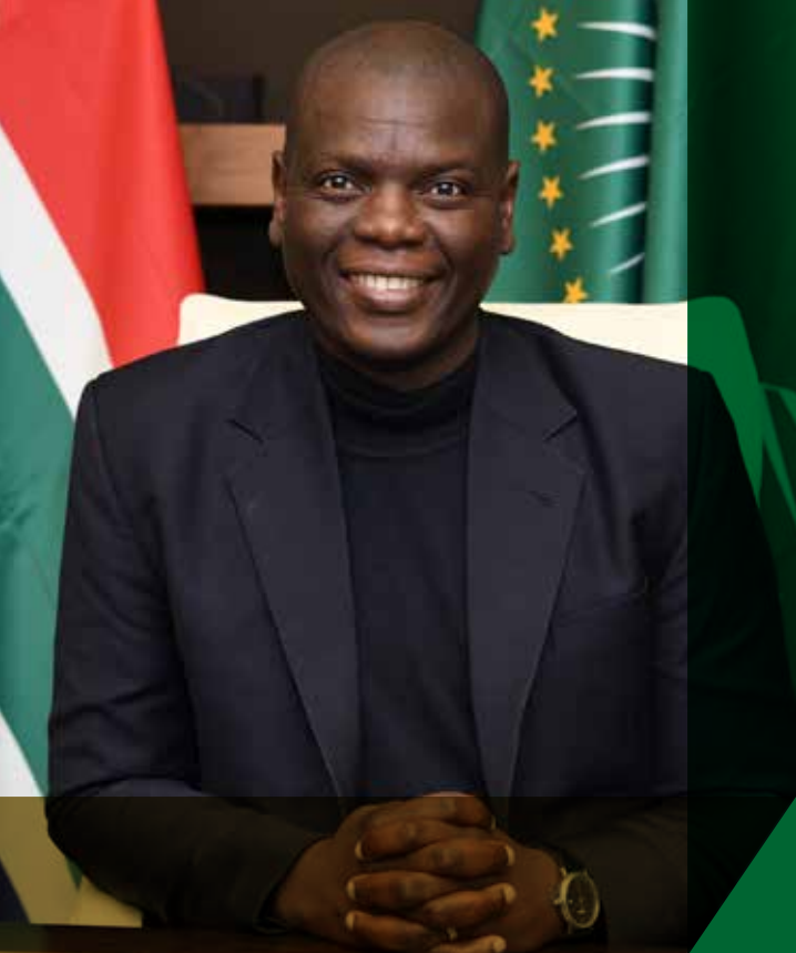
Ronald Lamola Minister of International Relations and Cooperation