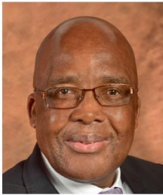
Dr Aaron Motsoaledi MINISTER OF HEALTH